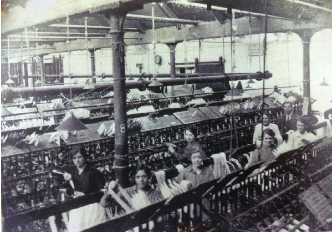
Pleasance Linen Works circa 1920's

Article in The Fife News : Cricket – Falkland v Dunnikier :