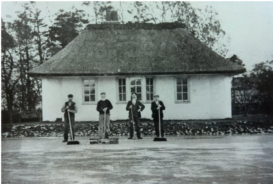
Falkland Curling Pond c1920

Extract from The Fife News : Curling – “Owing to the recent spell of hard frost, the curlers have enjoyed a few friendly matches on the ice.”