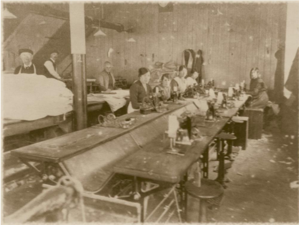
Linen Factory Finishing Department circa 1920

Extract from The Fife News : Strike – “The employees of the Pleasance Linen Works struck work on Tuesday morning owing to a few of the workers being non-Union members. At a meeting held on Tuesday night, no definite settlement was reached.”