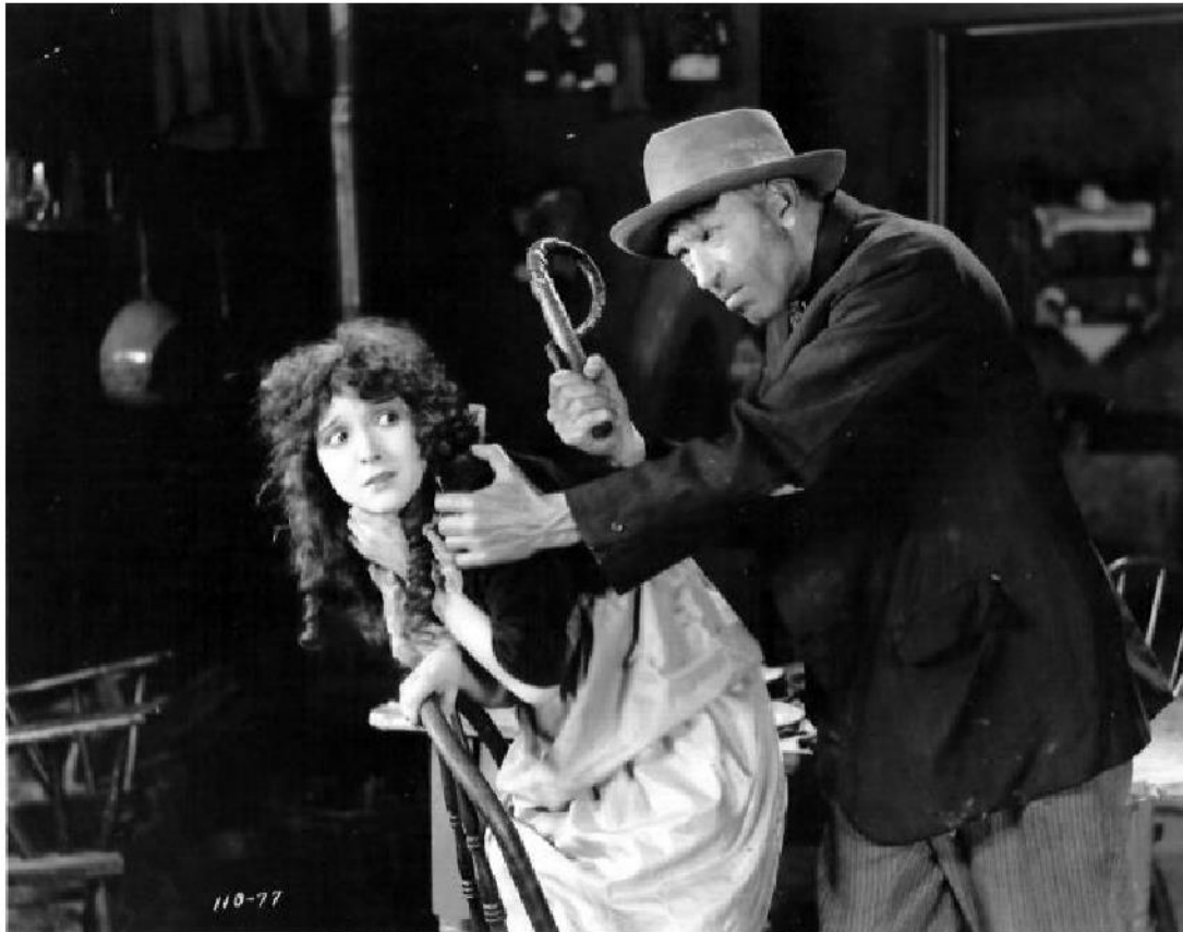
Scene from 'Hail the Woman' (1921)

be screened. This colossal production shows a story in which one can 'live' as he sees the picture."