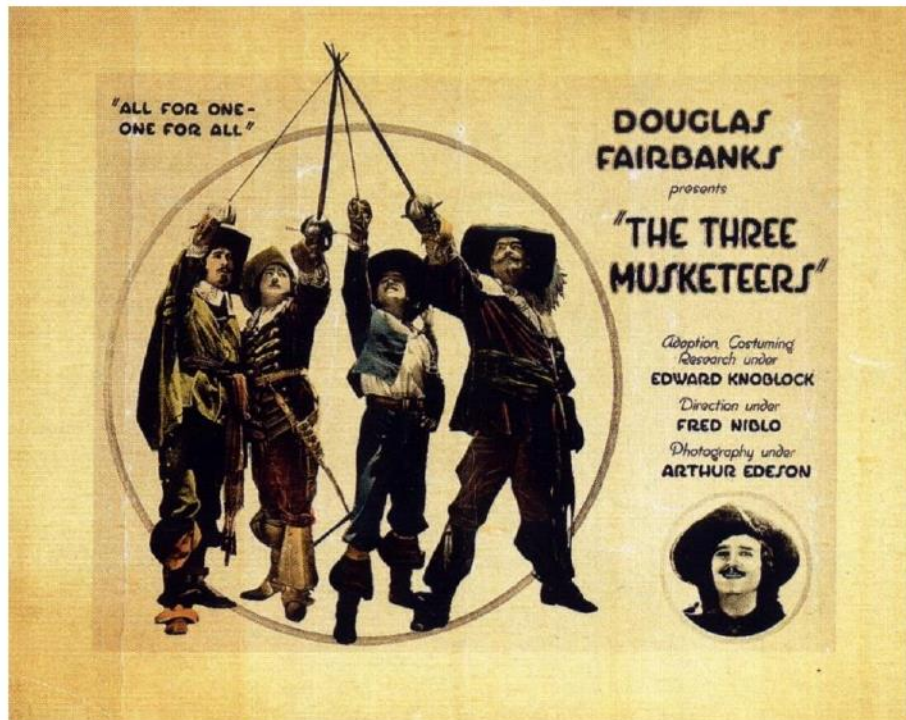
The Three Musketeers (1921)